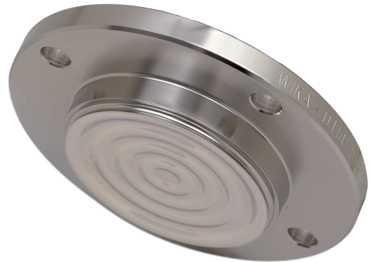
Diaphragm seal with sterile connection, model 990.60

For further technical information on diaphragm seals and diaphragm seal systems see IN 00.06 „Application, operating principle, designs“.