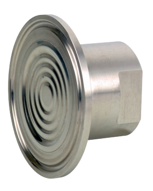
Diaphragm seal with sterile connection, model 990.22