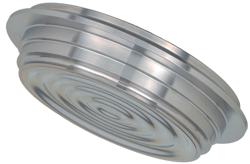
Diaphragm seal with sterile connection, model 990.24

The model 990.24 diaphragm seal with VARIVENT® connection is particularly suited for use in sterile processes and is