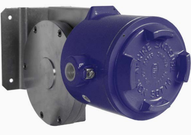
Fig. left: For medium/high setting ranges, model APA Fig. right: For low setting ranges, model APA10